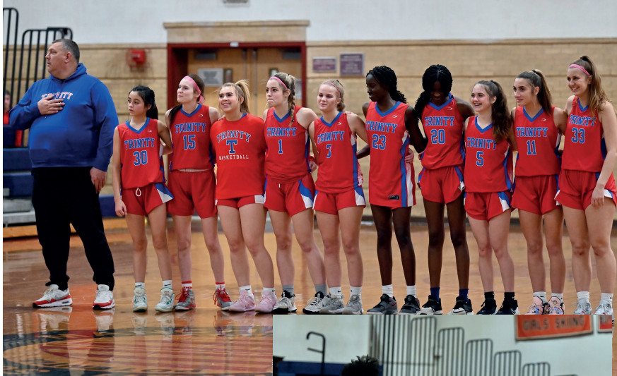
Trinity Girls Basketball team - Trinity vs. Memorial game