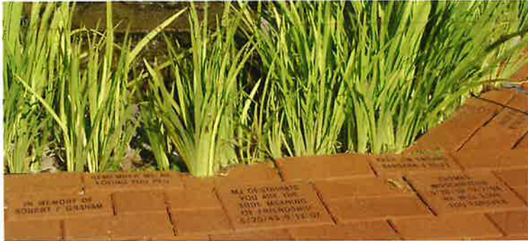
4" x 8" Brick- $250.00 Our Lady of Unity Courtyard

Be part of something greater by memorializing, dedicating or recognize your family legacy here at Trinity by donating a personalized brick to be placed in the newly renovated Trinity Gym Entrance or Our Lady of Unity Courtyard unifying Trinity High School and the St. Joseph Regional Junior High School addition. This is a great opportunity to add your mark on our new school partnership.