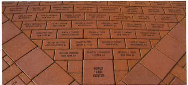
4" x 8" Brick- $250.00 Display in Gym Entrance

Fill brick dedication, memorial or message boxes below: