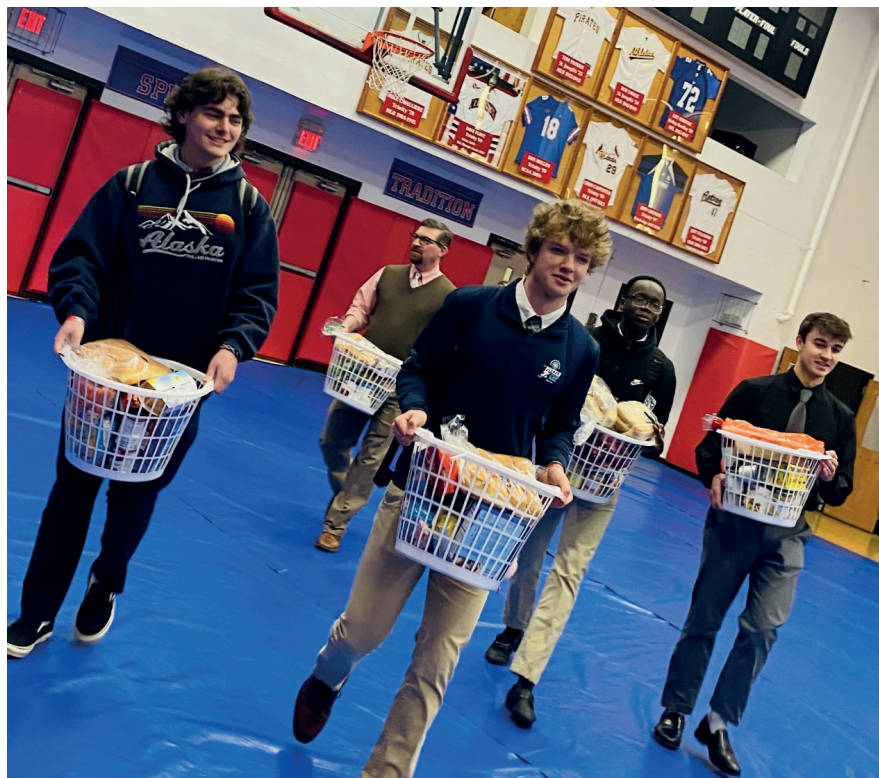
Pioneers helping others!