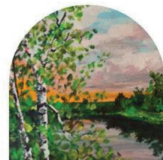
CAROLE STORRO NEW ENGLAND ABSTRACT ARTIST